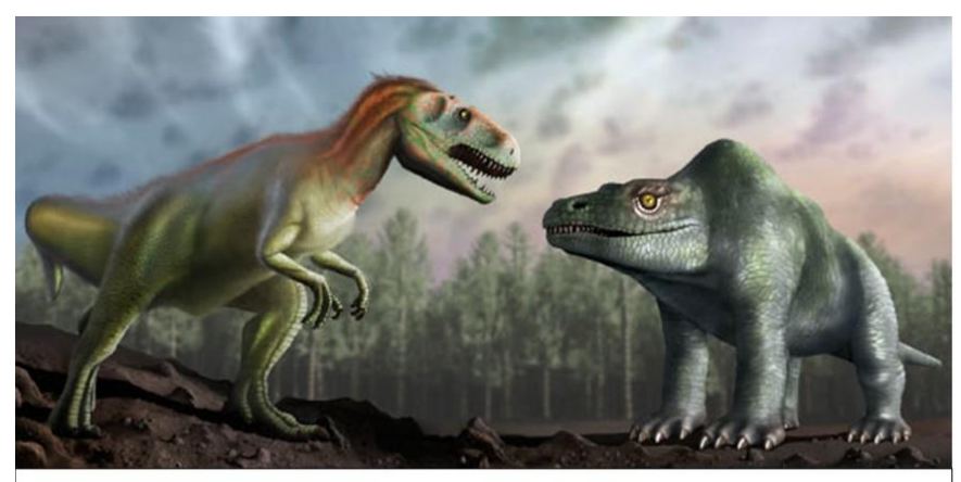
Artist's impression of how Victorian palaeontologists thought Megalosaurus bucklandii looked (right), compared with how we now understand it to have looked (left).

While dinosaurs as such are science fact, they have always featured in SFF stories, starting from early examples such as A JOURNEY